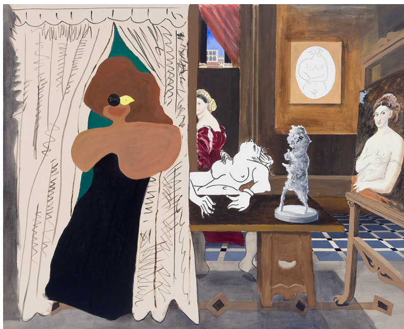
Left: Cover of Lest , Right: Six Fornarinas , 2011, oil and acrylic on canvas, 51 x 63 in.; Collection: FRAC Limousin, Limoges, France.